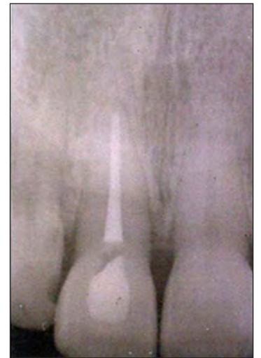
Figure 16. Radiographic view 2 years postoperatively confirms the osseous repair.

Alloplastic graft materials are readily available and inexpensive. These materials can be utilized as an alternative to autogenous donor material or allografts, without the risk of disease transmission and morbidity. Utilization of alloplastic materials is not associated with an immunologic response to antigens. Numerous animal and human studies have demonstrated histologic and clinical efficacy of low-temperature SBRG. 32,33 In one such study involving grafts that were implanted into the ileum of rats, the SBRG material demonstrated a significant increase in bone formation as compared to the control of other graft materials when implanted for more than 7 days. Further, this study demonstrated that SBRG was associated with enhanced bone formation in bony voids as compared to plastic graft material, and that bone fill progressed over time. It was concluded that SBRG also demonstrated a higher chemotactic response and cell-binding capacity when compared to other particulates. 34 A study by Ruano compared the effect of ceramic hydroxyapatite versus nonceramic hydroxyapatite (OsteoGen) for cell growth capacity and procollagen synthesis of cultured human gingival fibroblasts. The study showed that "viable cells were