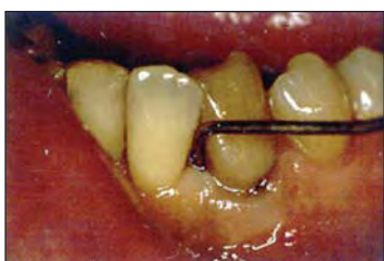
Figure 9. Preoperative view reveals deep pocketing at the mesial aspect of the cuspid tooth.