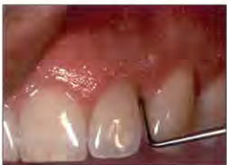
Figure 3. Preoperative facial view reveals deep pocketing at the distal aspect of the lateral incisor.