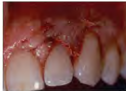
Figure 6. The mucoperiosteal flap is sutured in place.