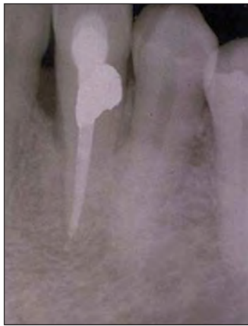
Figure 12. Radiograph 2.5 years postoperatively indicates bone fill.