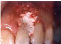
Figure 5. Facial view demonstrates the placement of OsteoGen and Capset composite graft to fill the infrabony defect.