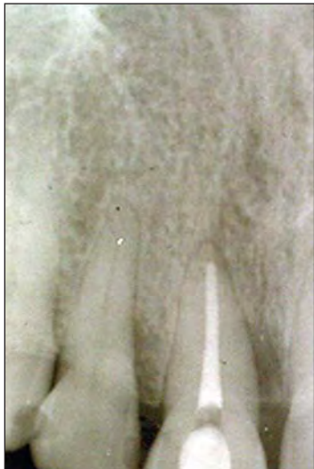
Figure 14. Presurgical radiograph demonstrates osseous loss mesial to the incisors.