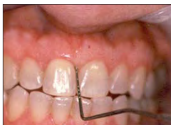
Figure 15. Pocket depth is clearly within acceptable limits 1 year postoperatively.

normal disinfection or sterilization procedures. 17 Although allogeneic or xenogeneic materials (human or bovine) used as grafts are treated with gamma radiation or by acid demineralization, the potential for disease transmission must be considered. 17-19 This does not represent a problem for alloplastic graft material.