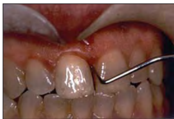
Figure 13. Facial view preoperatively. Note the presence of deep pocketing mesial to the incisors.