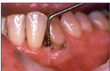
Figure 11. The defect 2.5 years postoperatively displays significant reduction of the periodontal pocket.

to periodontal defect applications." 13,14