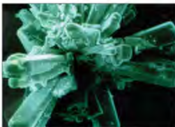
Figure 1. SEM of OsteoGen showing one crystal cluster approximately 300 to 400 micron.

Results of one clinical and histologic study suggest that DFDBA alone may have little or no osteoinductive potential. 11 Another study concluded that DFDBA does not induce bone regeneration, resorbs sporadically, and may in fact interfere with normal bone formation. After placement into a defect, the material maintains its sponge-like state and may act as an inhibitor to bone formation; thus it is not ideal for implant support. 11,12 However, Garg reported that allografts of DFDBA, which may be cortical or trabecular, have