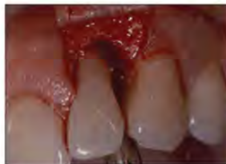
Figure 4. Upon flap elevation, an infrabony defect is evident at the distal aspect of the lateral incisor.