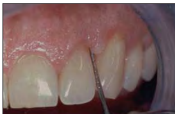
Figure 8. Two-year postoperative view demonstrates successful maintenance of pocket reduction.