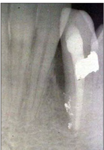
Figure 10. Preoperative radiograph exhibits deep bone loss to apex. Extraneous amalgam particles line the apical portion of the defect.