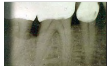
Figure 18. Radiograph of the site 1 year postoperatively indicates osseous repair.

significantly small in numbers for cultures grown with ceramic hydroxyapatite when compared to OsteoGen." 35