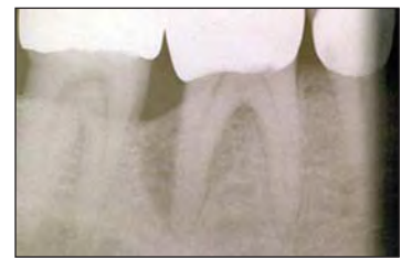
Figure 17. Preoperative radiograph displays osseous loss to apex. Furcal involvement is also apparent.