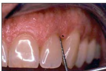
Figure 7. Facial view 6 months postoperatively illustrates significant pocket reduction.